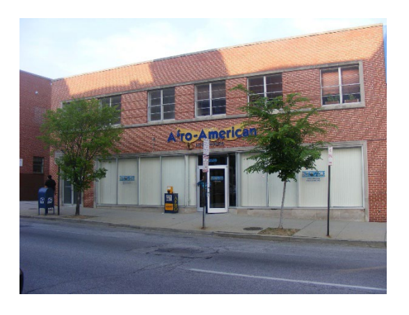
One of the recent locations of the paper in Baltimore (on Charles Street): Marylandstater, Public domain, via Wikimedia Commons